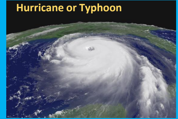
Hurricane or Typhoon