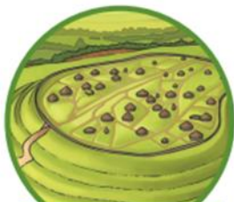
An Iron Age hillfort

It took at least 20 years to train to be a Druid. However, we only know about them from what the Romans wrote down.