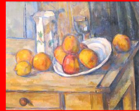
Paul Cezanne -Still life of milk and fruit