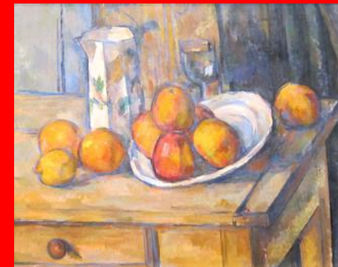
Paul Cezanne -Still life of milk and fruit